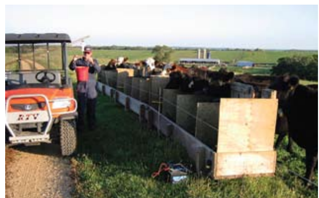
Electronic gates allowed steers in all treatments to graze together and have access to the supplement assigned to them.

The increased performance of supplemented animals did impact carcass characteristics. Use of grain co-products produced heavier carcass weights and